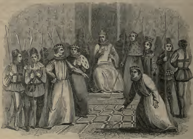
THE EARL MARSHAL CHALLENGING THE EARL OF DERBY. FROM MSS. OF THE FIFTEENTH CENTURY.

The earl of Derby was confounded at this address, and retired a few paces, without demanding from the duke his father, or any of his friends, how he should act. Having mused a while, he advanced, with his hood in his hand, towards the king, and said, “ Earl marshal, I say that thou art a false and wicked traitor, which I will bodily prove on thee, and here is my glove.” The earl marshal, seeing his challenge was accepted, showed a good desire for the combat, by taking up the glove and saying,—“ I refer your answer to the good pleasure of the king and the lords now present. I will prove that what you have said is false, and that my words are true.” Each of these lords then withdrew with his friends, and the time for serving wine and spices was passed by ; for the king showed he was sore displeased, and retired to his chamber and shut himself within it. His two uncles remained without with their children, as did the earl of Salisbury and Huntingdon, the king’s brother.